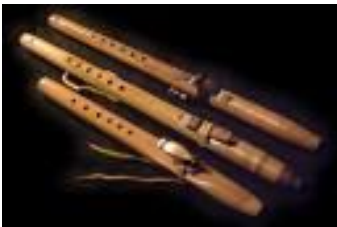
Next meeting: Native American Flutes!