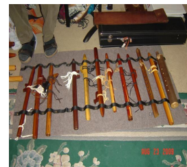
Native American Flutes