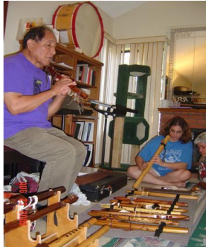
Ernest Siva : Native American Flute Artist, Musician, and Author

I just wanted to extend my thanks to everyone who helped out in designing our new logo. I must say the colors look amazing. The logo made its premiere earlier this month as it was placed lovingly on all of our flute festival flyers. Thanks again everyone!